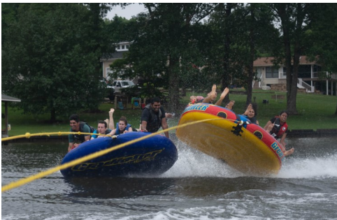
A summer day at Lake Gaston