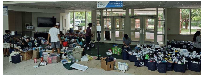
Welcome bags for new students